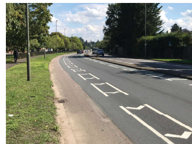
Hersham by pass controversy