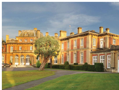
Esher Place House under threat